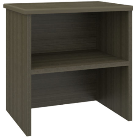
Model: A2BH 20.5W 11.75D 20H

Taking on a new twist from an old classic, the Atlanta II re-invents itself by adding feet for a wonderful new design with tried and true appeal. Cleaning and maintenance are simple and easy when case goods are elevated. Available with or without contrasting edges as well as custom color combinations.